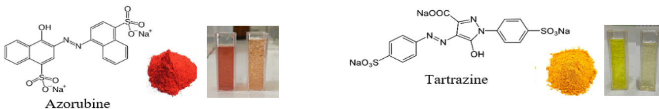
Figure: Catalytic activity.

Silver nanoparticles (AgNPs) were obtained in one step, green, nontoxic, rapid and economic method, using Lycium barbarum fruit extract as a source of reducing and stabilizing agents. UV-Vis spectroscopy, transmission electron microscopy, and Fourier-transform infrared spectroscopy, were used to characterize the newly obtained nanoparticles. The catalytic activity of the obtained nanoparticles was evaluated in the reductive degradation process of two azoic dyes used in the food industry: azorubine and tartrazine. The AgNPs mediated degradation of the dyes was proceeded 3.2 and respectively 1.6 times faster than in the absence of any catalyst (Figure).