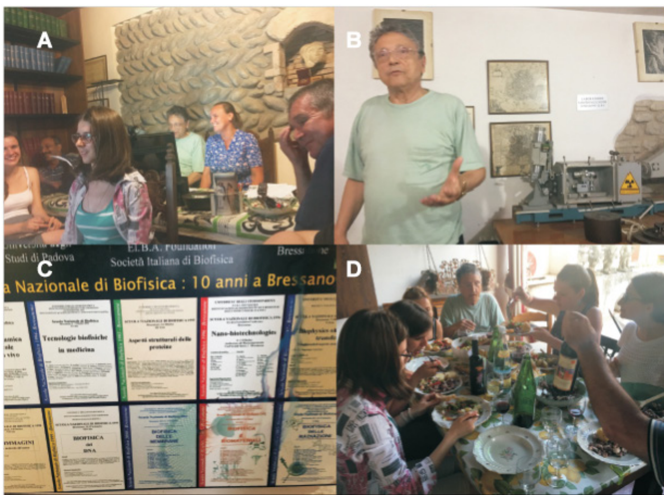
Figure 1: (A) Among the participant of XLI Nanoforum, 23 June 2016, Pradalunga (B) Explaining the applications of historic nanotech instruments (C) Posters with the programs of the former Italian Autumn Schools on Biophysics, Bressanone. (D) XLI Nanoforum closing party. Forty octopuses were sacrificed for the sake of science and education - eyes for rhodopsin extraction, tentacles - to feed the participants.