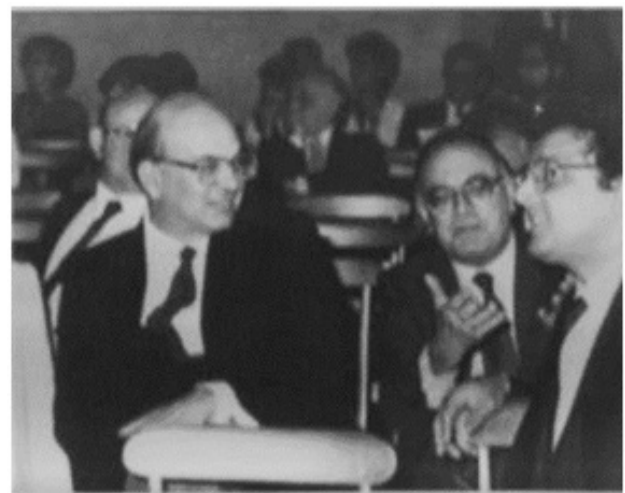
Figure 8: Prime Minister Craxi and Finance Minister Formica with Claudio Nicolini.

structural proteomics, new organic nanotechnology, new instrumentation (AFM and LB) and new sensors for health and environment. This received the strong support of the Italian government with an 8-years long multibillions Bioelectronic Research program. At the same time the Italian government was providing big support for science and technology in the key area of biotechnology and nanotechnology. From 1983 to 1987 Nicolini acted as advisor for Science and Technology to the Prime Minister Craxi (Figure 8).